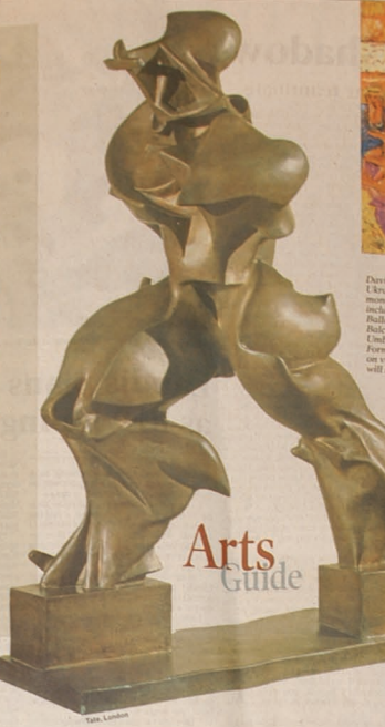
David Burliuk, the "Furber of Russian and Ukrainian Futurism," is the subject of a monographic exhibition in New York that includes "On the Train" (1922, above, Giacomo Balla), a landscape painting "Girl Running on a Terrace" (1922) will be in a Rome exhibition. Burliuk's 1922 sculpture, "Unique Forms of Continuity in Space" (1913), is currently on view at the Estorick Collection in London and will be on display at Tate Modern in June.

FRANCE | PARIS Centre Pompidou June 12 to Sept. 20. "Futurism." The exhibition, now on view at the Centre Pompidou in Paris (see "Closing Soon") and traveling to Rome, will emphasize the Futurist influence